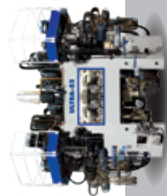
FLEXIBLE TRANSFER MACHINES