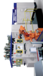
MILL-TURN MULTI-SPINDLE MACHINES