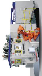
MILL-TURN MULTI-SPINDLE MACHINES